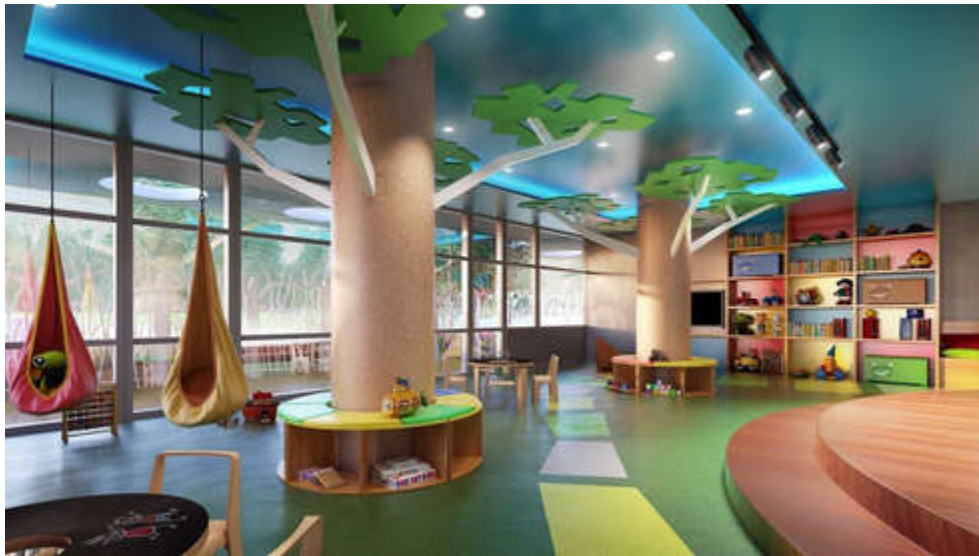
Children's Playroom (Coming in 2018)

Next up is LEVEL, a brand new rental tower that boasts seriously spectacular views of the East River, Manhattan skyline, and Brooklyn. It contains condo-like apartment finishes and amenities that can be accessed year-round, including an indoor pool with a skylight, whirlpool, and steam room, a 24-hour fitness center featuring technogym cardio and weights, a yoga room with virtual on-demand fitness classes, a club lounge with game tables and a demonstration kitchen, and finally, a party room with a kitchen. A true community, member events and activities will be coordinated weekly by LivUnLtd Concierge Service. Other perks include valet services and a gorgeous furnished lobby with a fireplace and 24-hour concierge.