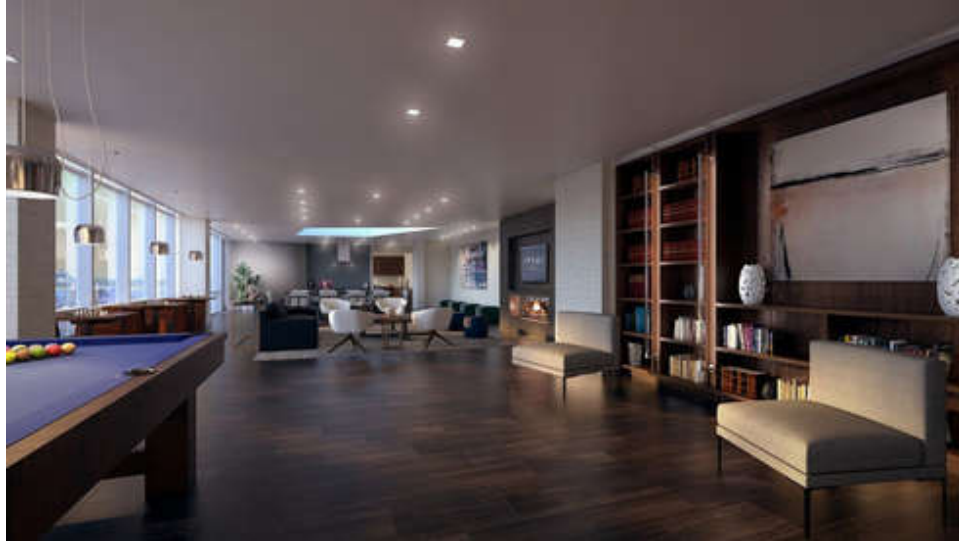
Lounge with billiards table